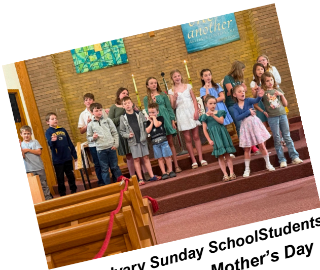
Calvary Sunday School Students sang during Mother's Day