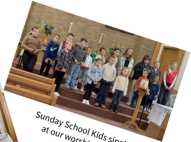
Sunday School Kids singing at our worship service.