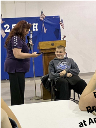
Big Paw Presentation at American Legion