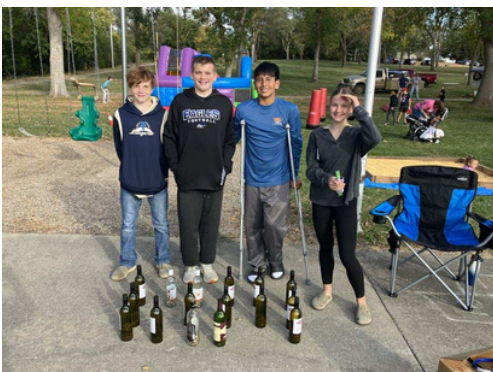
Leading games at the Irene Fall Festival