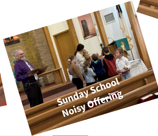
Sunday School Noisy Offering