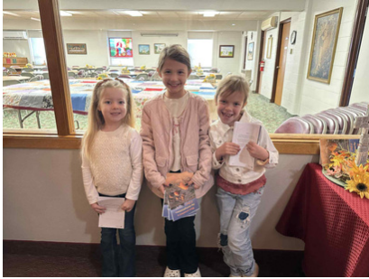
Above: Sunday School October Greeters Right: Sunday School October Ushers

October was a busy month. Pastor Appreciation Month, Kids Worship Service Sunday, Confirmation and their activities. Was a good month for Calvary and our Youth!