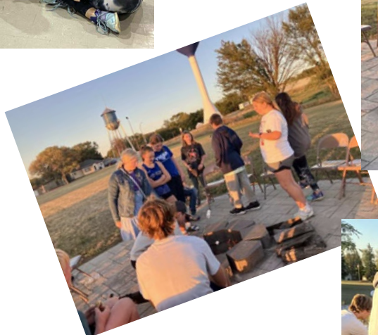
Confirmation Students having a Hot Dog Roast by the campfire pit on the hill!